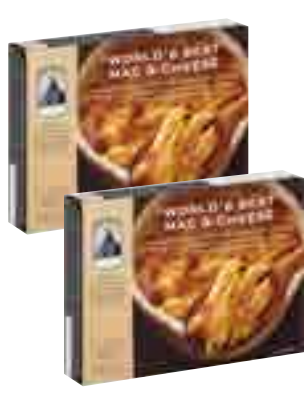
20 oz. Beecher's Mac & Cheese