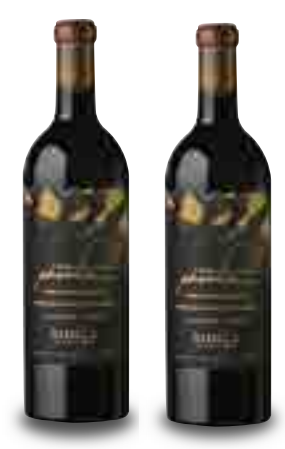
750 ml. Bogle Phantom Red Blend

$199 each Price With Half Case Discount $1619 each