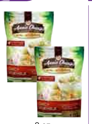
8 oz. Annie Chun's Mini Wontons

Save at least $1.00 each with your VIC card