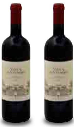
750 ml. Villa Antinori Toscana Red

Price With Half Case Discount $1529 each