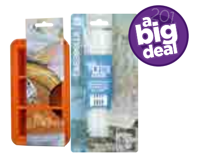
Assorted Casabella Wine Accessories