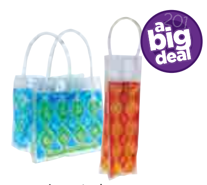
Assorted Chill-It Wine Bags