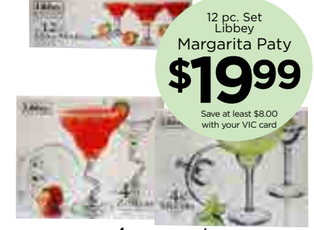
4 pc. set Libbey Margarita Glasses