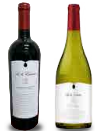
750 ml. Lodi Estates Cabernet Sauvignon or Chardonnay

$199 each Price With Half Case Discount $1619 each