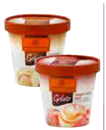
14 oz. Mario Batali Gelato