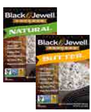
10.5 oz. Black Jewell Popcorn

Save at least $1.00 each with your VIC card