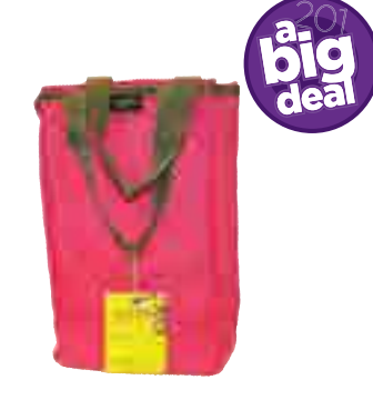
Assorted Jute Insulated Wine Bags